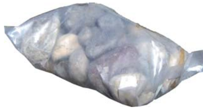
Pebbles in bag - 1