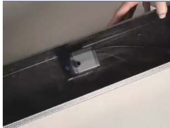
This is how the pump should rest in the tray. (Picture taken while tray is off the wall)

(5) Next apply the black pump pad to the side of the pump. You will notice the pump has sound dampening suction feet. When installed it should rest on the feet and the pump pad should be between the back of the water tray and the pump. This will help in quieting the sound of the motor.