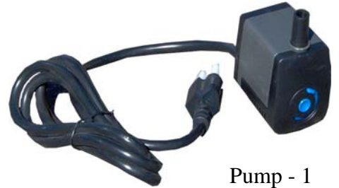
Pump - 1