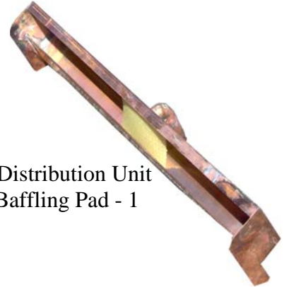
Water Distribution Unit with Baffling Pad - 1