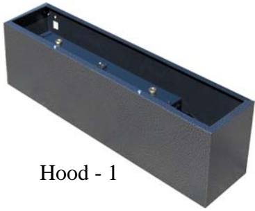
Hood - 1