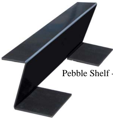
Pebble Shelf - 1