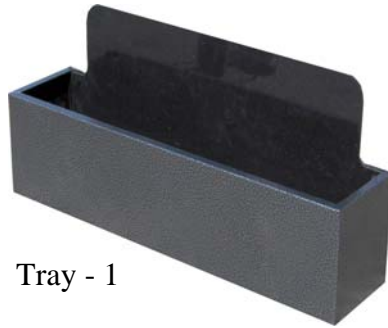
Tray - 1