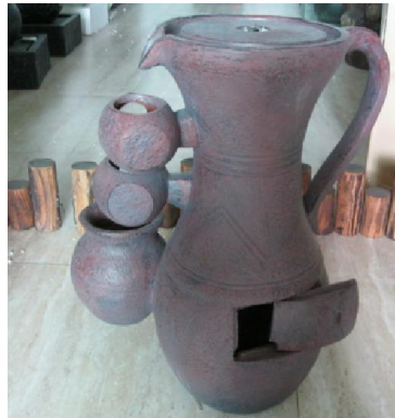
3) Now close the door as attachment.