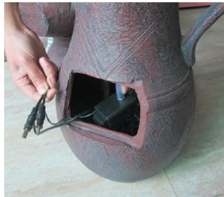
2) Put the bump on the bowl.