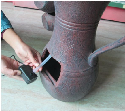
1) Connect the tube to the pump.

Locate a flat, firm surface to place your fountain. Once you have found the perfect spot for your fountain, place the base upright in the desired area.