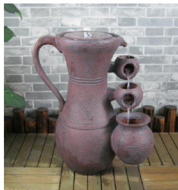
4) The final product.