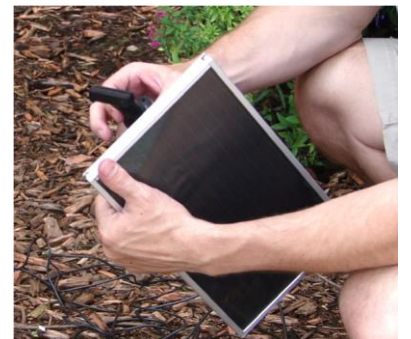
Step 9- Assemble solar panel