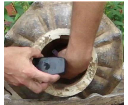
Step 6 - Attach water hose to pump