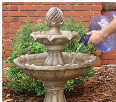
Step 8- Fill both tiers with water.