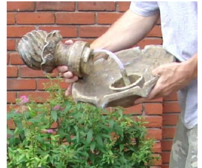
Step 3 - Feed water tube through 2nd tier