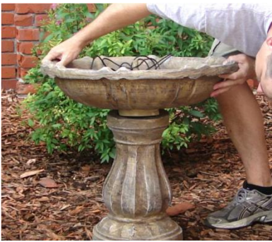
Step 1 - Twist and lock large tier to base pedestal