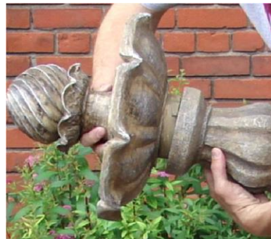
Step 5 - Twist and lock 2 nd tier to small pedestal.