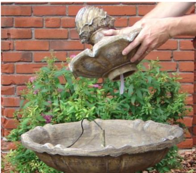
Step 4 - Twist and lock 2nd tier to top piece