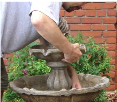
Step 7 - Twist and lock small pedestal to large tier