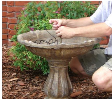
Step 2 - Feed pump cord through hole in large tier.